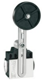
Adjustable roller lever KNF