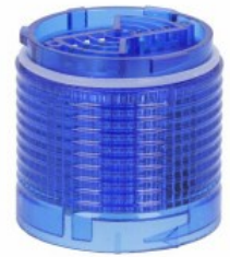
Signal tower Ø50mm/1.97" LTN50