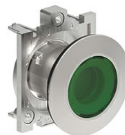
Illuminated button actuators, spring return - Flush LPFBL10