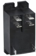
INDUSTRIAL RELAYS ATEX HR8020