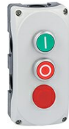
Grey control station LPZP2A8 complete with green flush pushbutton "i" LPCB1113 1NO, red flush pushbutton "o" LPCB1104 1NC and red pilot light 24V LPZP3B8900