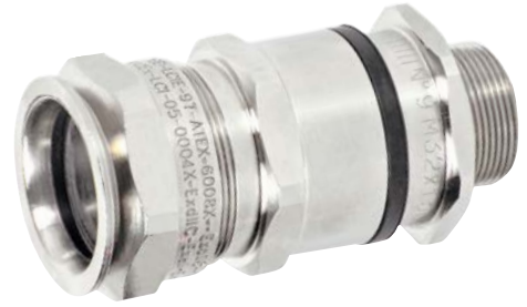
ADE 6F NPT