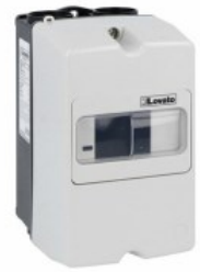
Surface mount enclosures IP65 (4X) for SM1P SM1Z Surface mount enclosures IP65 (4X) for SM1P SM1P...