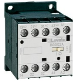
Auxiliary contactor BG00