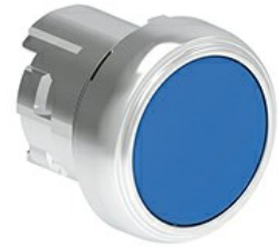
Pushbutton actuator, spring return LPSB10