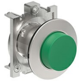
Pushbutton actuator, spring return LPFB20