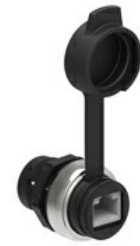
RJ45 interface, Ethernet connection with 1m long cable LPCD0 Cat.5E