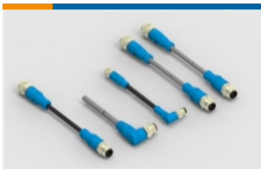
M8/M12 Cable Assemblies(135)