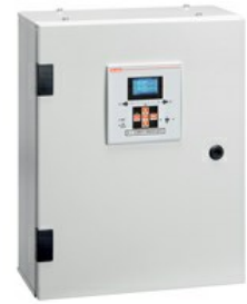
Enclosed automatic transfer switches ATS, with ATL600 controller and four-pole contactors, 100A ATP