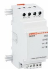
Expansion modules for modular products - inputs/outputs EXM1002