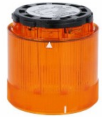
Signal tower Ø70mm/2.75" 8TL7GL - Light modules