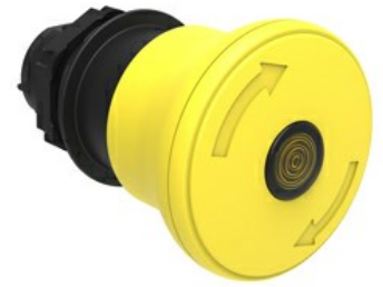
Illuminated mushroom head button actuators - Latch, turn to release Ø 40mm/1.6" LPCBL66