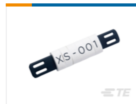
TE Part # 1SET512008R0000 CTO-Marker-0-100-6-WH