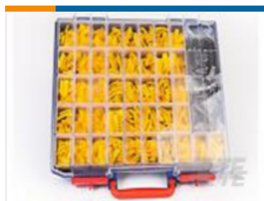
TE Part # 1SET512001R0000 CTO-Kit-4200-YL