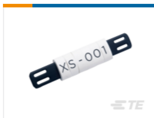
TE Part # 1SET512005R0000 CTO-Marker-0-100-3-WH