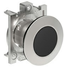
Pushbutton actuator, spring return LPFB10