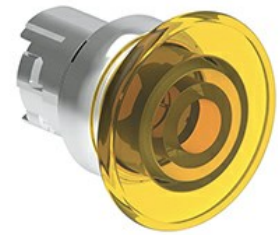
Illuminated mushroom head button actuators - Spring return Ø 40mm/1.6" LPSBL61