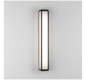
CODE: 1121058 FINISH: BRONZE

THIS PRODUCT IS SUITABLE FOR ONEROUS ENVIRONMENTS AND CAN BE INSTALLED WITHIN FIVE MILES OF THE COAST - THREE YEAR WARRANTY APPLIES.