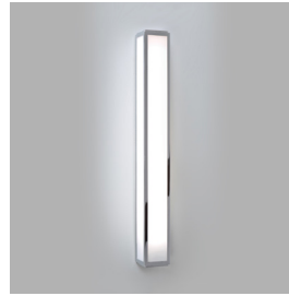
CODE: 1121020 FINISH: POLISHED CHROME