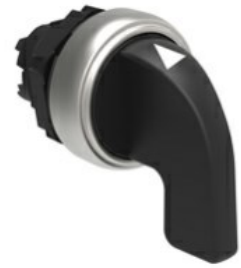
Selector switch actuators long lever - 3 position LPCS23