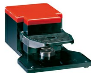
One pedal, with free actuation - open KG100