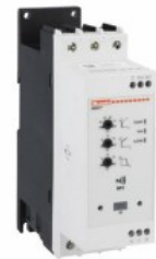
Soft starter advanced ADXNP Asynchronous three phase