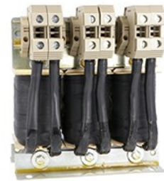
Three phase motor choke VLXM150 150A 0.08mH, suitable for drives size 55...75kW