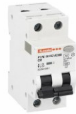
Residual current circuit breakers (RCCB) with overcurrent protection P1RE 1P+N 2 IEC