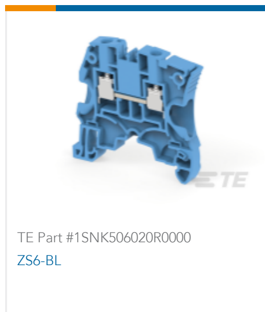
TE Part #1SNK506020R0000 ZS6-BL