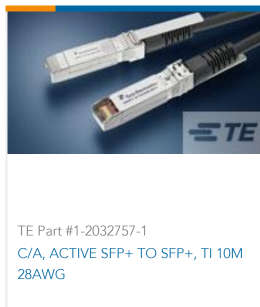
TE Part #1-2032757-1 C/A, ACTIVE SFP+ TO SFP+, TI 10M 28AWG