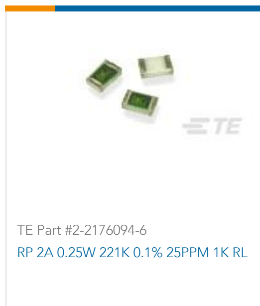
TE Part #2-2176094-6 RP 2A 0.25W 221K 0.1% 25PPM 1K RL