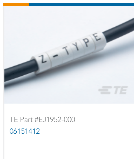
TE Part #EJ1952-000 06151412