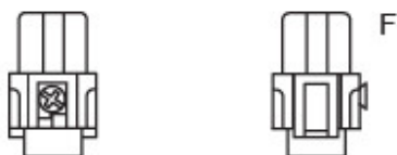
contacts side (front view)