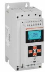
Soft Starter ADXL Asynchronous three phase

Product designation Product type designation Motor type