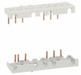
3P Rigid connecting kits for BF09...BF25 BFX3102