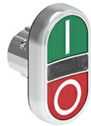
Double-touch actuators, spring return white indicator - Two flush pushbuttons LPSBL71