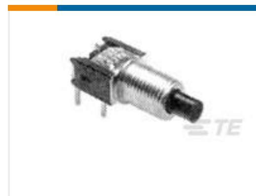
TE Part #1825100-4 TPF11CGRA004