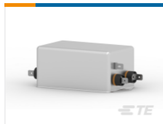
TE Part #2-6609037-6 12EP1=F8217