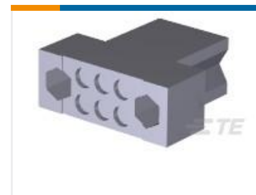
TE Part #202757-1 6 POS. FEM. BLOCK