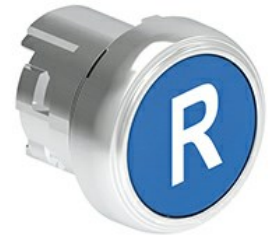
Pushbutton actuators, spring return, with symbol LPSB11