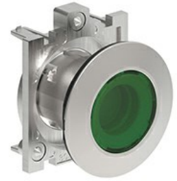
Illuminated push-push button actuators - Flush LPFQL10