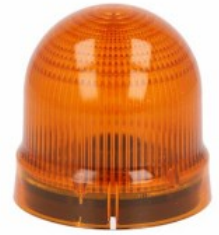
Signal beacons Ø62mm/2.44" 8LB6GL