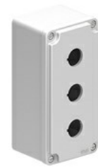
Enclosures with cut-outs for Ø22mm units - with hole for 3 actuators LPZM