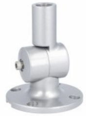
Signal tower Ø50mm/1.97" LTN50