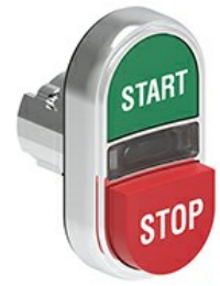
Double-touch actuators, spring return white indicator - One extended and one flush pushbuttons LPSBL72