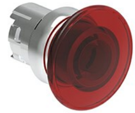
Illuminated mushroom head button actuators - Spring return Ø 40mm/1.6" LPSBL61