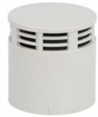
Signal tower Ø50mm/1.97" LTN50