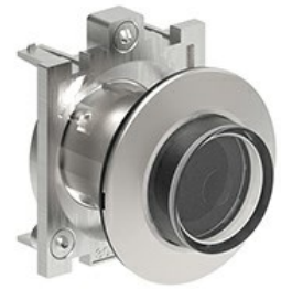
Illuminated button actuators, spring return - Extended LPFBL20