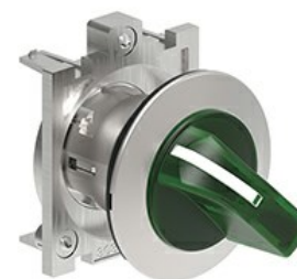
Illuminated selector switch actuator - 3 position LPFSL13