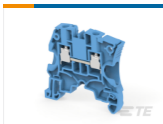
TE Part #1SNK506020R0000 ZS6-BL