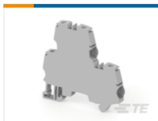
TE Part #1SNK506210R0000 ZS6-D2