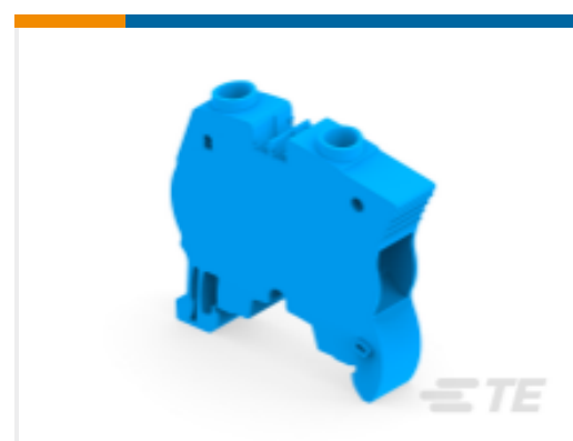
TE Part #1SNK510020R0000 ZS16-BL