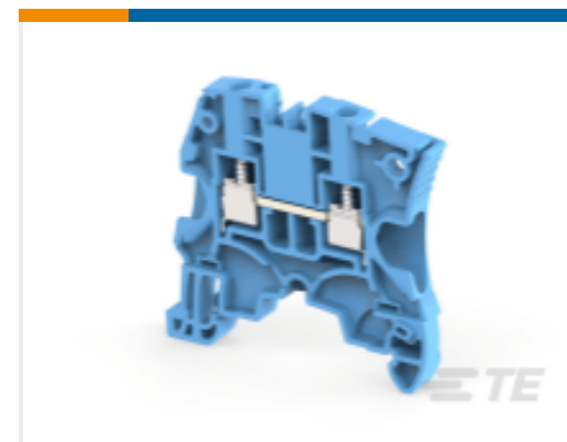
TE Part #1SNK505020R0000 ZS4-BL