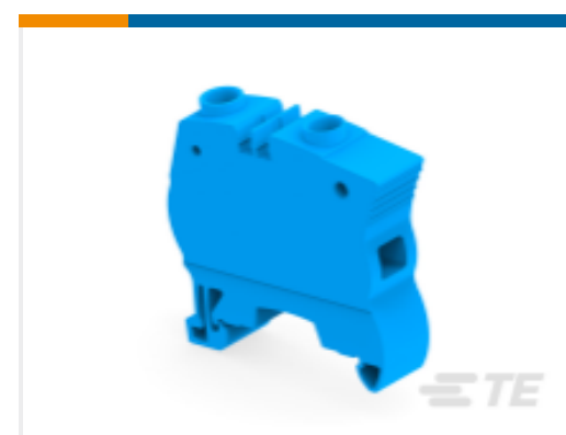
TE Part #1SNK512020R0000 ZS25-BL