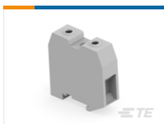
TE Part #1SNK522010R0000 ZS70