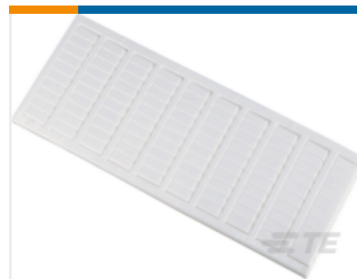
TE Part #1SNK140022R0000 MC512PA 11->20 (x10) Vertical