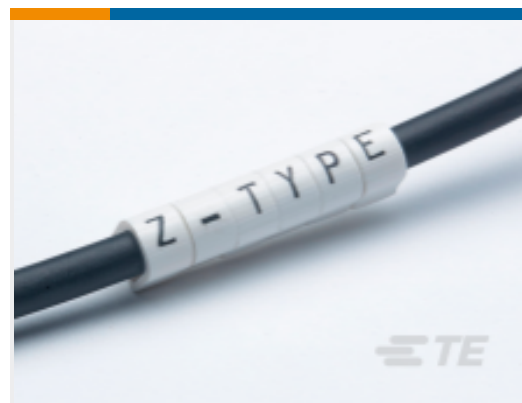
TE Part #EC0234-000 Z-Type Push-On Markers