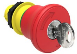
Mushroom head pushbutton, Latch, turn key to release Ø 40mm/1.6" LPCB684