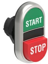
Double-touch actuators, spring return - One extended and one flush pushbuttons LPCB72