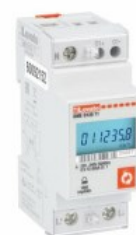
Single-phase energy meters DMED120T1 single-phase 2