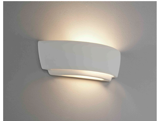
CODE: 1301001 FINISH: CERAMIC

TO MAINTAIN THIS PRODUCT TO ITS BEST CONDITION, PLEASE VIEW OUR CARE AND CLEANING GUIDE ON THE SUPPORT SECTION OF THE ASTRO WEBSITE.