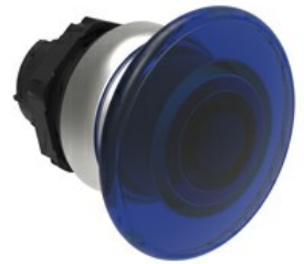
Illuminated mushroom head button actuators - Spring return Ø 40mm/1.6" LPCBL61