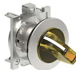
Illuminated selector switch actuator - 3 position LPFSL13