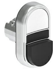
Double-touch actuators, spring return - One extended and one flush pushbuttons LPSB72