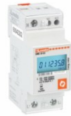
Single-phase energy meters DMED122 single-phase 2